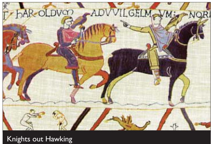
Knights out Hawking

(hd_1) Domesday Survey-Glossary (hd_23) Normans and Hunting (hd_8) Henry de Ferrers (hd_18) Castles - Norman (m_8) Great Britain and Pilsbury 360° Panorama